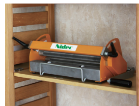
Lightweight, Compact and Portable