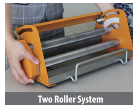
Two Roller System