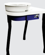
SHIMPO RK-3E Extension Legs

Optional Accessory: SHIMPO RK-3E extension legs to throw standing. The legs are made from heavy gauge, powder coated steel and designed with a curve for extreme stability. The legs will raise the SHIMPO RK-3E to a height of 889 mm to 939 mm in 25.4 mm increments.