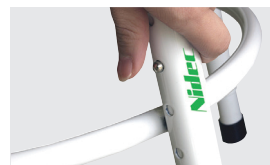
482 mm - 660 mm (tilt seat feature)