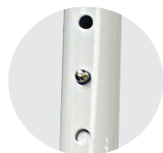
Adjustable Legs (Nine adjustable slots, 25.4 mm increments)