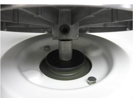
4)Wheel head bolt must be (5)Tighten wheel head bolt tightened to flat side of through the hole in pan shaft to ensure wheel head is secure