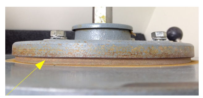
Round Bearing Holder with groove

If your RK-2 has a round bearing holder with a groove then it can hold a two piece splash-pan. Contact Shimpo Ceramics for additional splash-pan info.